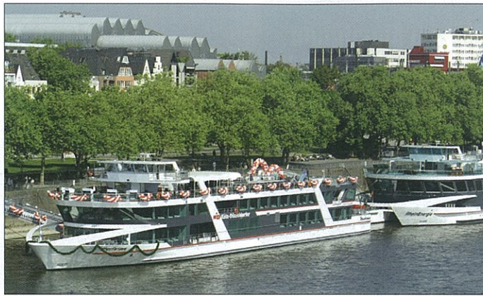
■ KD's two Rhine event vessels are seen side by side in Cologne.

Designed by the Büro Schiffstechnik Buchloh on the Rhine, the three deck RheinFantasie is similar in style and concept to KD's 1,650 passenger catamaran RheinEnergie . However, RheinEnergie , which has been in service since 2004, is bigger at 90.3m long and 19.3m wide and also has total available space of 2,000m 2 .